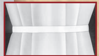
Back Detail 425