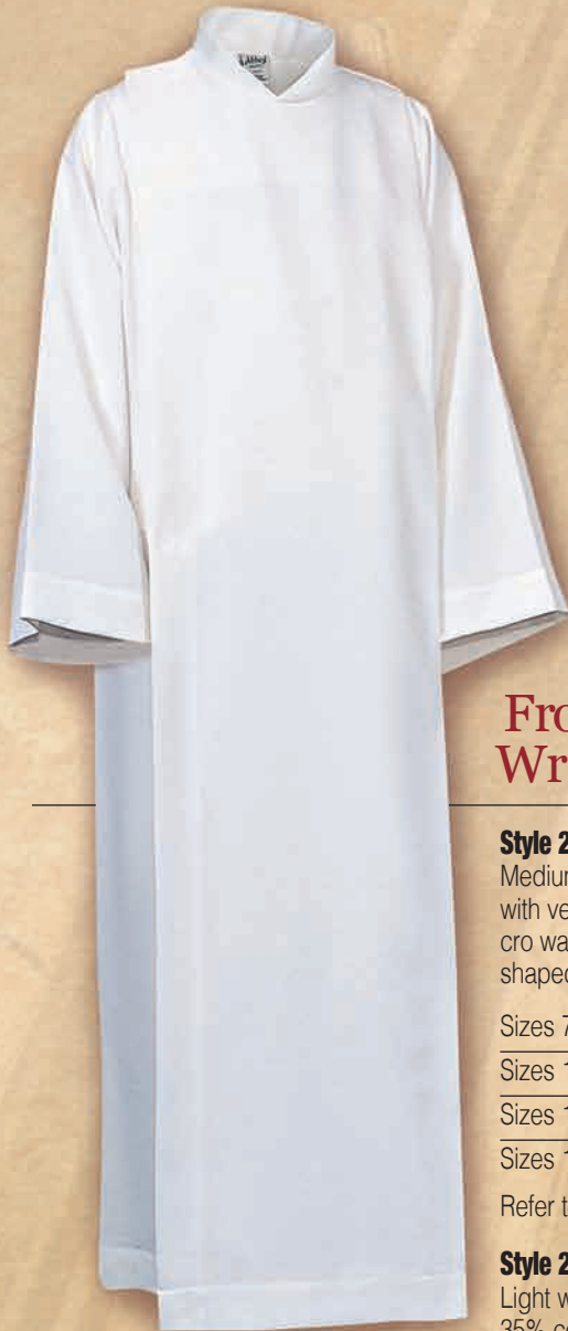
Style 225 Style 226