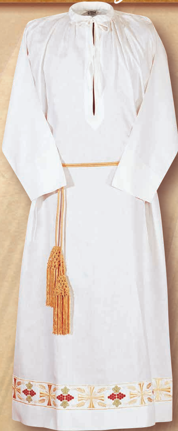
Garment style 55 with Banding style 1878 – No.55-1878